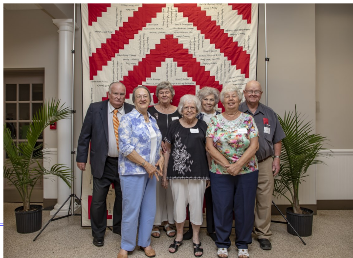
Class of 1961