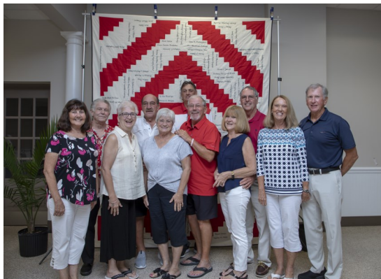
Members of the Class of 1970 celebrated their 50 year reunion in 2020.